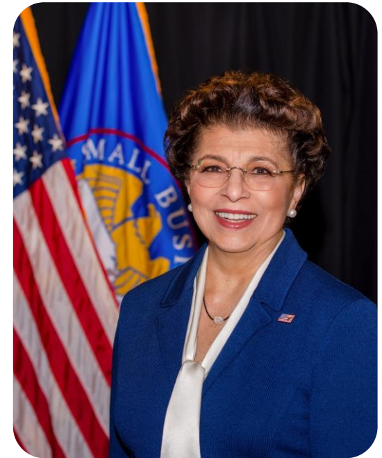
Administrator Jovita Carranza

The U.S. Small Business Administration (SBA) is offering designated states and territories low-interest federal disaster loans for working capital to small businesses suffering substantial economic injury as a result of the Coronavirus (COVID-19).